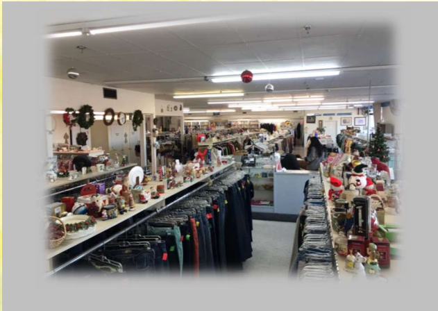
ChristTown Thrift Store